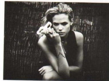
Black wrap dress w. V-neck KENZO All jewelry NOON FARE